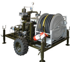
Fuel Transfer Pump – FTP