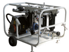
Portable Refueling Pump – PRP