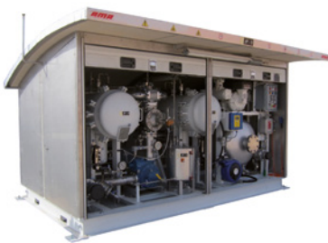
Loading/Unloading Skid – LUS