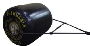
Air Portable Fuel Cell – APFC