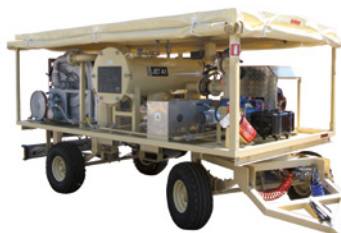
Aviation Fuel Trailer – AFT