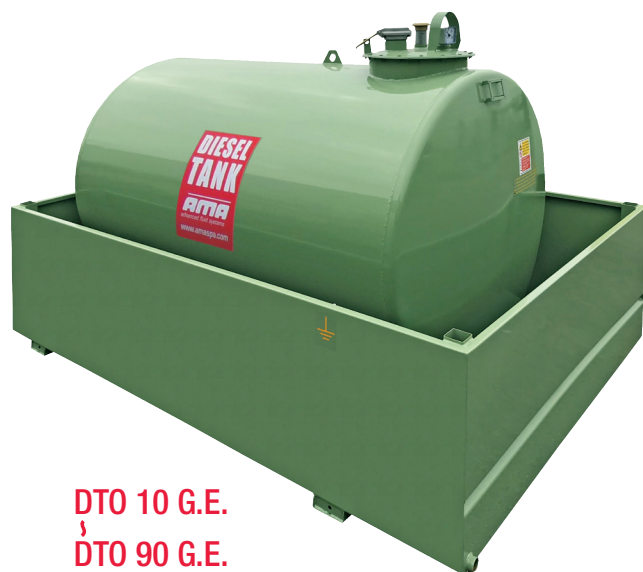
DTO 10 G.E. } DTO 90 G.E.