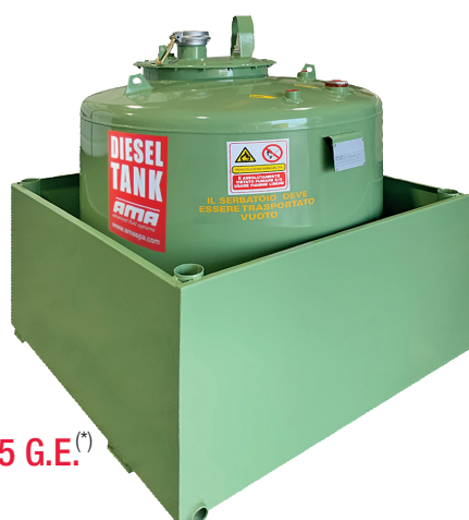
DTV 05 G.E. (*)