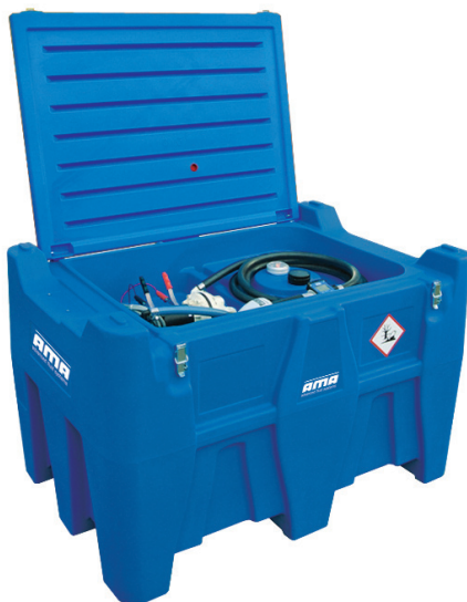
TT MOBILE ADBLUE® 440

The TT MOBILE ADBLUE® is a linear polyethylene tank designed for AdBlue®/DEF transport and delivery. It is fitted with: lockable lid (for mod. 440), built-in forklift pockets, handles for lifting and carrying the empty tank and integrated grooves for securing the tank with ratchet straps during transport.